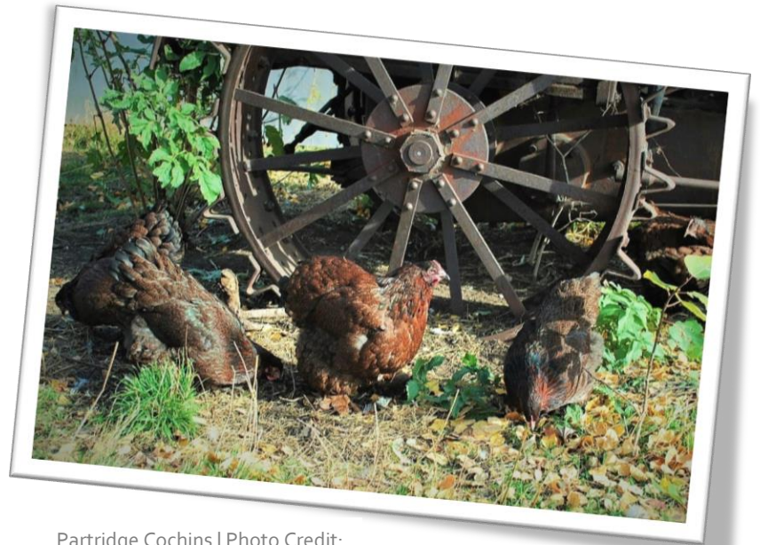
Partridge Cochins | Photo Credit: Hawthorn Hill Poultry

Our membership includes every level of enthusiast from the first time urban coop owner to farmers with decades of experience raising heritage breed animals. CHB also encourages youth involvement with a developing Juniors program. Although CHB is based in Central Alberta we aim to create a resource for not just Alberta, but