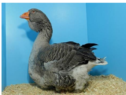
Grey Toulouse Goose

When compared with other poultry, geese are the best suited to simple low-input management. Light and medium breeds of geese thrive on a diet of grass and forbs during the growing season, with virtually no need to supplementary feeding. Through the winter, when they are not able to graze, geese consume only small amounts of grain, and are able to make use of other feeds like good quality alfalfa hay and pellets. Their dense down and thick fat cover insulate them against all but the very coldest temperatures. While all geese are able to survive these cold temperatures, the knobs on their bills are liable to get frostbite. The goose's ability to use grass like no other domestic birds and their incredible hardiness makes for a very low maintenance birds that can offer a lot to their owners. When these management aspects are coupled with their usefulness as a farmyard guard and the fact that a good goose can easily win a show makes for a bird unparalleled in the poultry world.