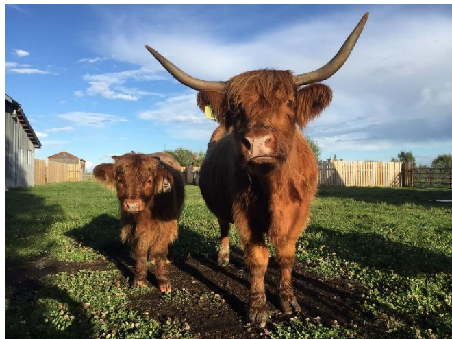
Highland Cattle | Photo Credit: Norland Brae Farm

If you would like to be part of the show committee, please send an email to callum.kaarsoo.mcleod@gmail.com to be sent an invitation to the call.