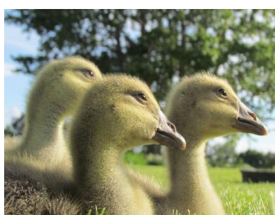
Toulouse Goslings