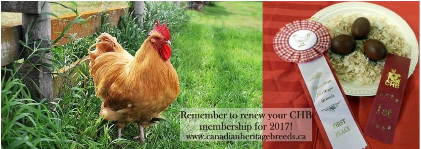
Buff Orpington Rooster

A reminder to members to purchase or renew your 2017 CHB website Breeder's Directory listing! CHB members are invited to promote and market their heritage breeds animals and products through the CHB website for only $10 per year! There is no limit to the number of heritage breeds and products that can be listed by each member.