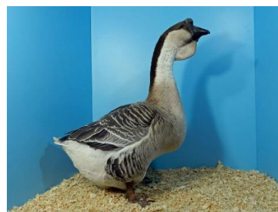
Brown African Goose