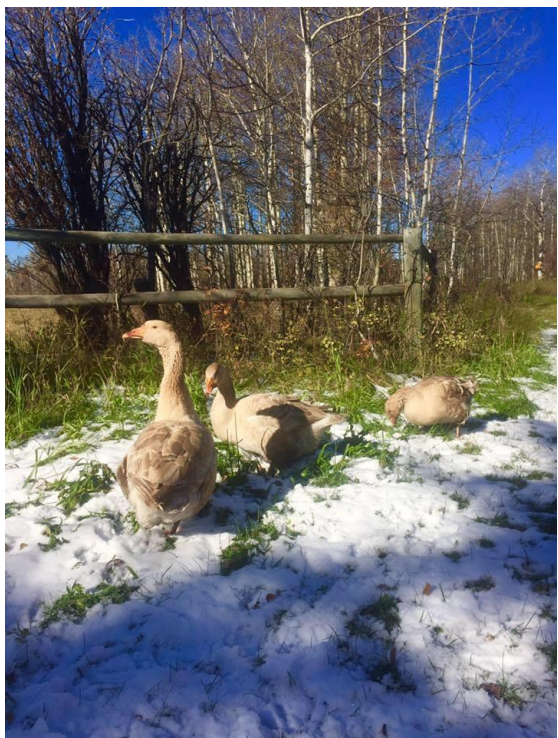
American Buff Geese

There are twelve breeds of geese that have been standardized by the American Poultry Association. Two of these breeds, the Canada and the Egyptian, are semi-domesticated ornamentals that do not really fall into the category of 'livestock.' The ten remaining breeds are divided into three weight classes: heavy, medium, and light.