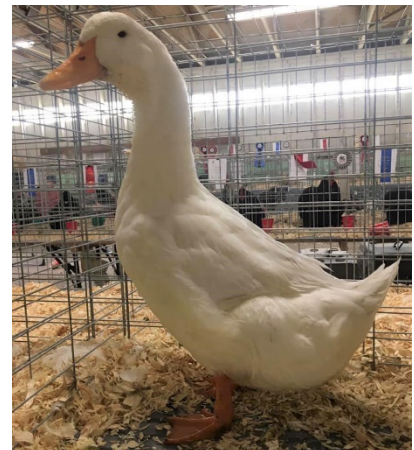
Champion Waterfowl, Mountain View Ranches