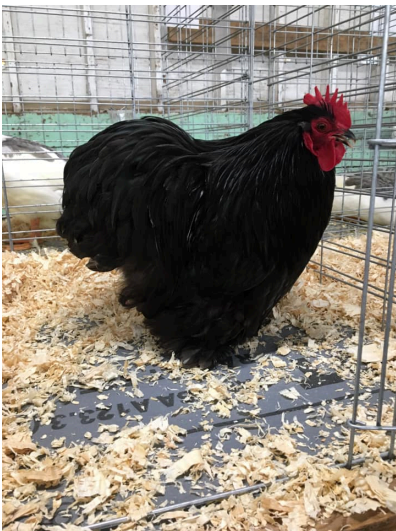
Show Grand Champion, Adam Scanlan

Reserve Grand Champion: Wheaten Old English Game Bantam Cock, Silver Ridge Aviaries