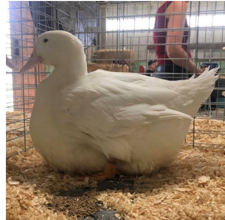
Reserve Waterfowl, Evergreen Farms

Reserve Waterfowl: Aylesbury Old Duck, Evergreen Farms