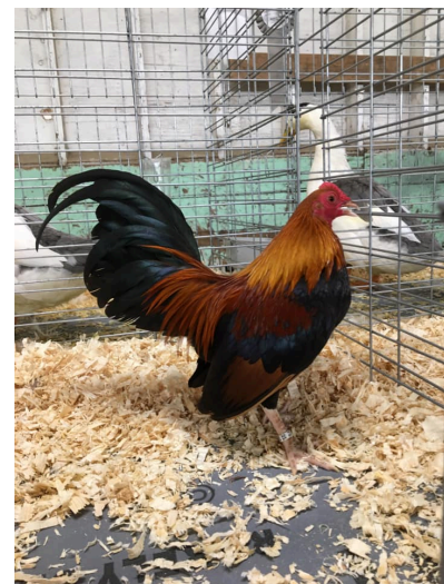
Show Reserve Champion, Silver Ridge Aviaries