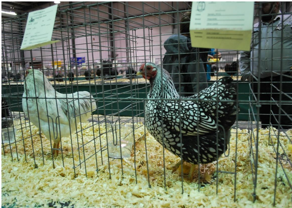
NEWS AND INFORMATION ABOUT THE UPCOMING ANNUAL FALL SHOW