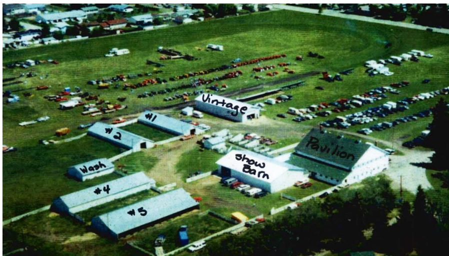
Lacombe Ag Grounds